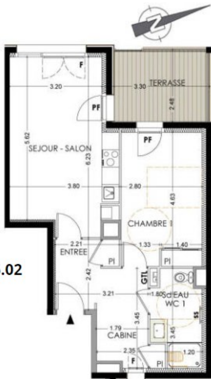
2 Rooms Cabin n°6.02

Surfaces : living 48,78 m 2 terrace 8,16 m 2