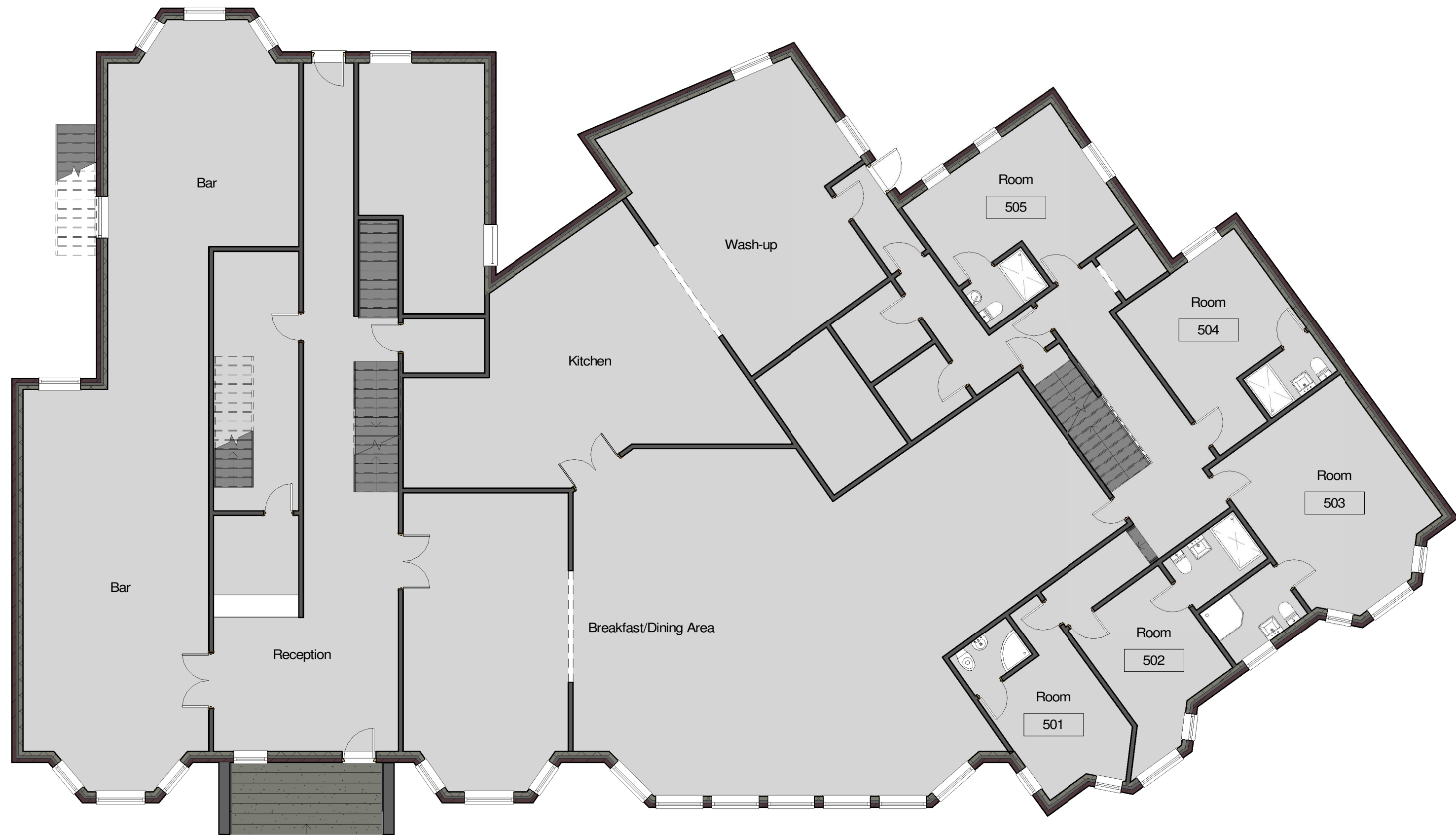
1 01. Ground Floor Plan 1 : 100